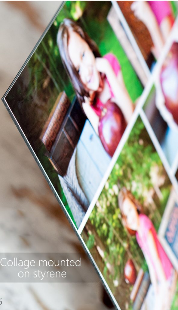
Collage mounted on styrene